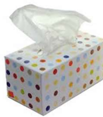
1 Box of Tissues