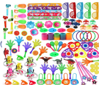
Treasure Box Items