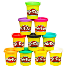
(2) Play-Doh any color