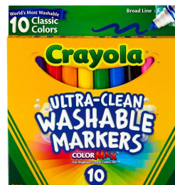
1 pack of washable markers