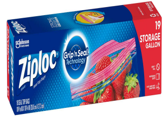
1 Box Ziploc Gallon Bags (BOYS)