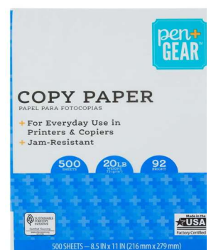
1 Ream of Copy Paper