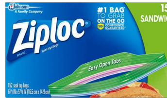
1 Box Ziploc Sandwich Bags (GIRLS)